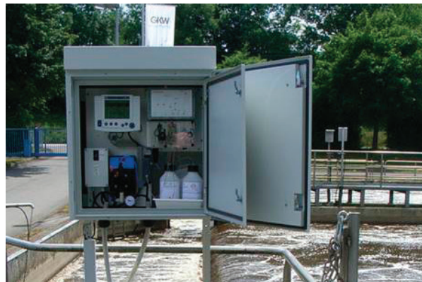
Figure 1: YSI IQ SensorNet P700 Orthophosphate Analyzer

Rick Wenzel, Process Supervisor for the Control Center, considered many options before recommending the IQ SensorNet P700 Orthophosphate Analyzer ( Figure 1 ) from YSI, a Xylem Brand. Low reagent consumption and user-defined automatic calibration to a standard were the key differentiators.